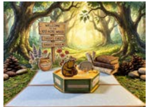
Sample of what you can do.

You will cut the same number of stands as you do for your slots and an additional one for anything you want to put in the middle. See video at SVGCOOP.com to see how to use the slots.